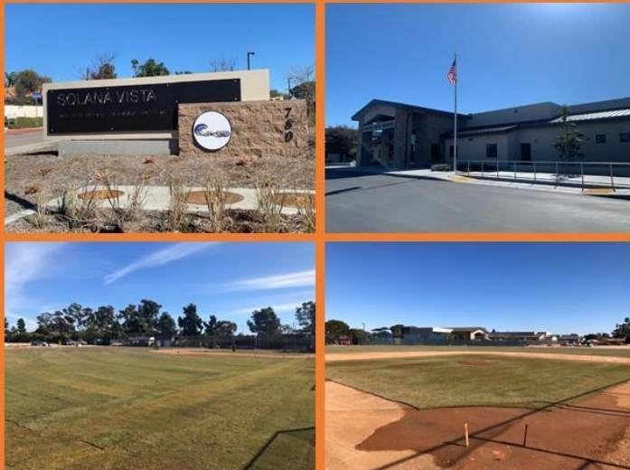
Solana Vista School Progress